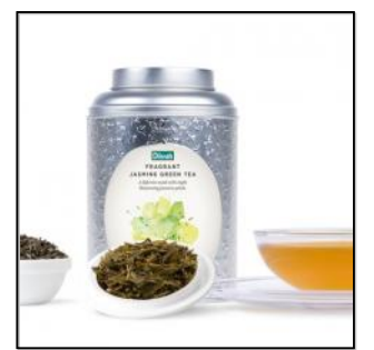
Vivid Fragrant Jasmine Green tea