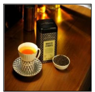
Silver Jubilee Nuwara Eliya Afternoon Tea