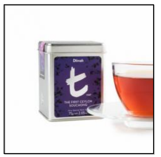
t-Series The First Ceylon Souchong