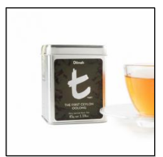
t-Series The First Ceylon Oolong