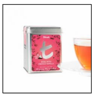
t-Series Rose With French Vanilla