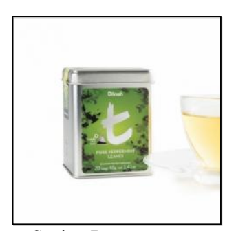
t-Series Pure Peppermint Leaves