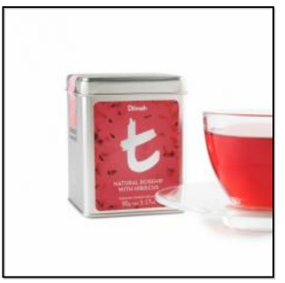
t-Series Natural Rosehip with Hibiscus