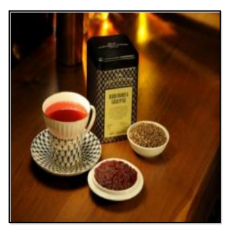
Silver Jubilee Blood Orange & Eucalyptus