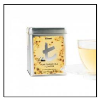
t-Series Pure Chamomile Flowers