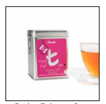
t-Series Prince of Kandy