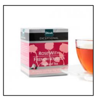
Exceptional Rose With French Vanilla