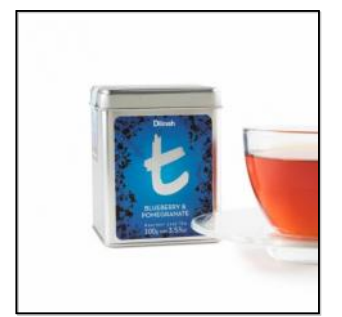
t-Series Blueberry & Pomegranate