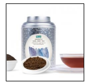
Vivid Aromatic Earl Grey Tea