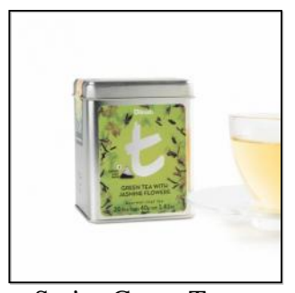
t-Series Green Tea with Jasmine Flowers