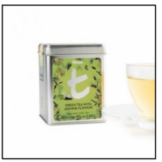
t-Series Green Tea with Jasmine Flowers