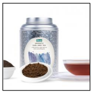
Vivid Aromatic Earl Grey Tea