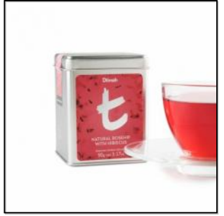
t-Series Natural Rosehip with Hibiscus