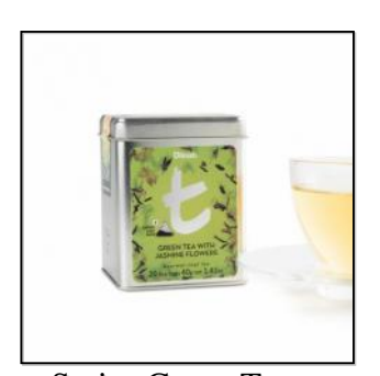
t-Series Green Tea with Jasmine Flowers