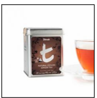
t-Series Natural Ceylon Ginger Tea