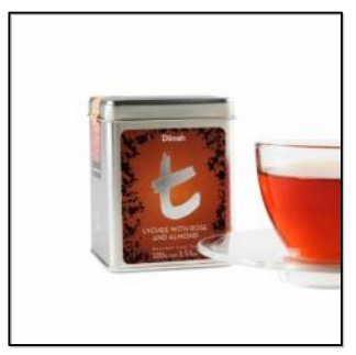
t-Series Lychee with Rose & Almond