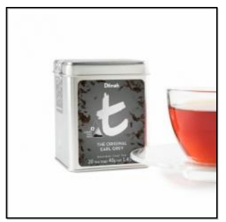
t-Series The Original Earl Grey