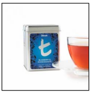
t-Series Blueberry & Pomegranate