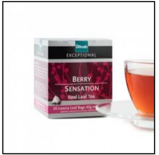
Exceptional Berry Sensation