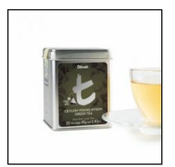
t-Series Ceylon Young Hyson Green Tea