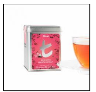
t-Series Rose With French Vanilla