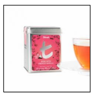
t-Series Rose With French Vanilla