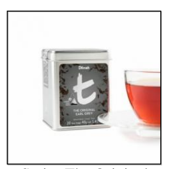
t-Series The Original Earl Grey