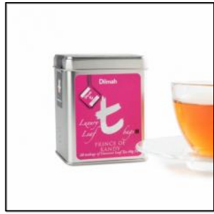
t-Series Prince of Kandy