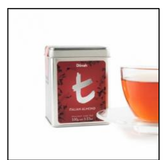
t-Series Italian Almond Tea