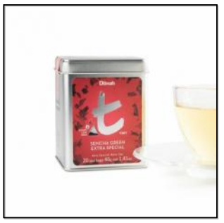
t-Series Sencha Green Extra Special