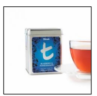
t-Series Blueberry & Pomegranate