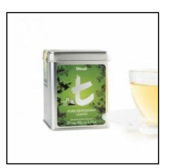
t-Series Pure Peppermint Leaves