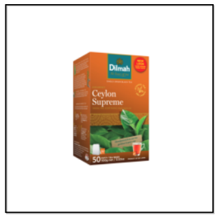
Gourmet Ceylon Supreme