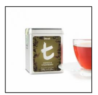
t-Series Mango and Strawberry