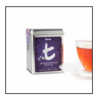
t-Series Ceylon Cinnamon Spice Tea