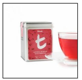
t-Series Natural Rosehip with Hibiscus