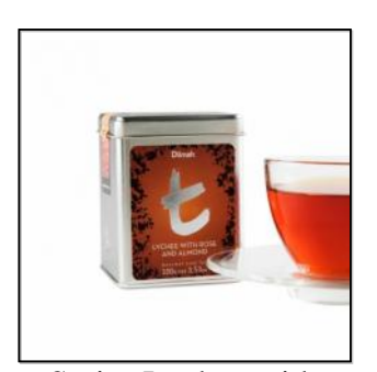
t-Series Lychee with Rose & Almond