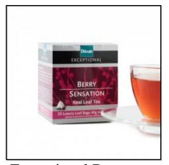
Exceptional Berry Sensation