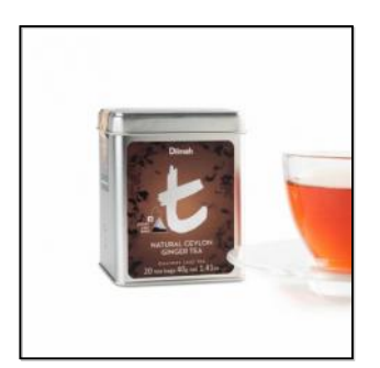
t-Series Natural Ceylon Ginger Tea