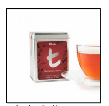
t-Series Italian Almond Tea