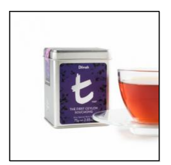
t-Series The First Ceylon Souchong