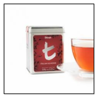
t-Series Italian Almond Tea