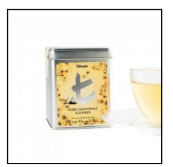
t-Series Pure Chamomile Flowers