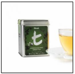
t-Series Moroccan Mint Green Tea