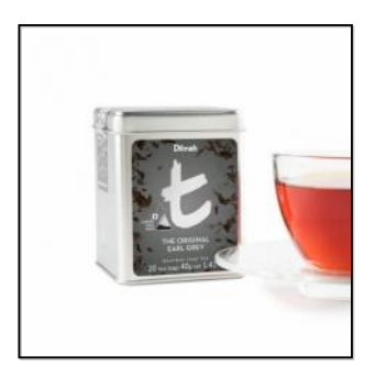
t-Series The Original Earl Grey