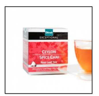
Exceptional Ceylon Spice Chai