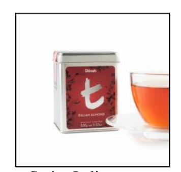
t-Series Italian Almond Tea