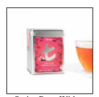
t-Series Rose With French Vanilla