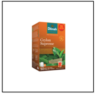
Gourmet Ceylon Supreme