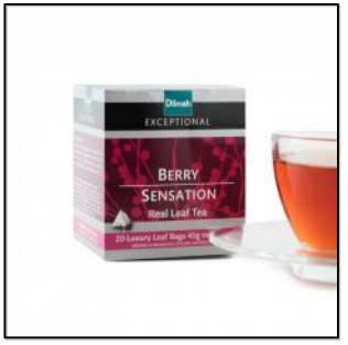
Exceptional Berry Sensation