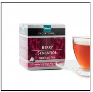
Exceptional Berry Sensation