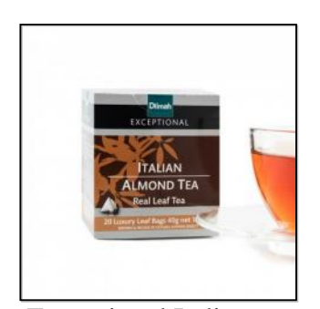
Exceptional Italian Almond Tea